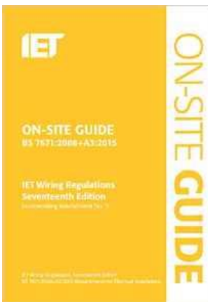
On-Site Guide BS7671:2008(2015) Wiring Regulations