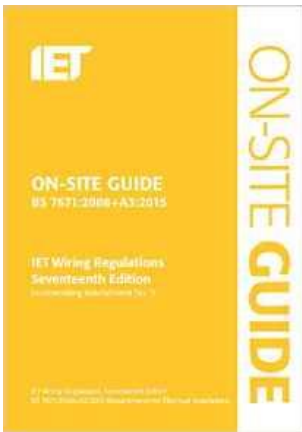
On-Site Guide BS7671:2008(2015) Wiring Regulations